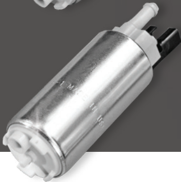
GSS352G3 11mm Inlet – Inline with the outlet