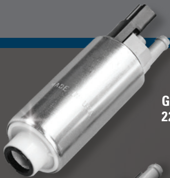
GSS350G3 22mm Center Inlet