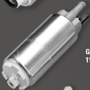
GSS351G3 11mm Inlet – 180° from the outlet